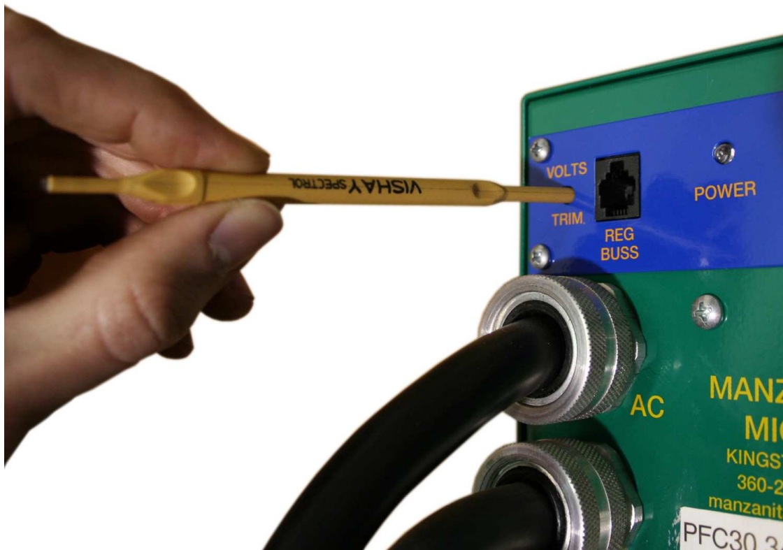
figure 03: VOLTS TRIM Adjustment

While charging, when the battery pack voltage hits the peak limit the yellow LIMITS LED will come on along with the flashing blue TIMER LED.